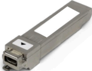
HDMI 2.0 Output