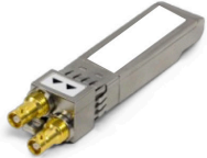
Dual SDI Output